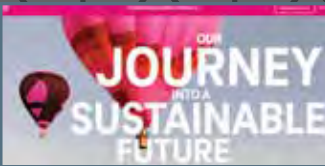
BEST OF GERMANY STAKEHOLDER REPORTING GmbH & CO. KG for DEUTSCHE TELEKOM AG