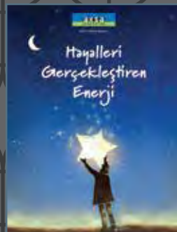
BEST OF TÜRKİYE FINAR KURUMSAL ILETISIM COZUMLERI LTD. STI. for AKSA POWER GENERATION