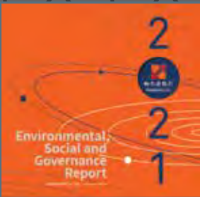
BEST OF CHINA TOPPAN MERRILL LIMITED for HARBIN BANK CO., LTD.