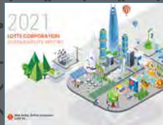
BEST OF KOREA TALANTONE CREATIVE GROUP for LOTTE CORPORATION