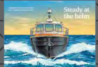
BEST OF USA CALIFORNIA WATER SERVICE GROUP