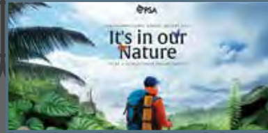
BEST OF SINGAPORE META FUSION PTE LTD for PSA INTERNATIONAL PTE LTD