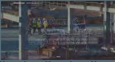
BEST OF AUSTRIA NEXXAR GmbH for WIENERBERGER AG