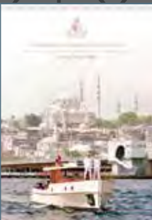
BEST OF HONG KONG SAR IONE FINANCIAL PRESS LIMITED for THE HONGKONG AND SHANGHAI HOTELS, LIMITED