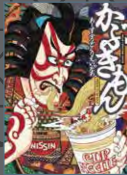
BEST OF JAPAN SHIAN INC. for NISSIN FOODS HOLDINGS CO., LTD.