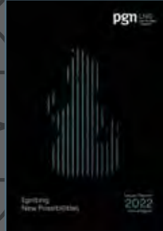
BEST OF INDONESIA DNA KOMUNIKA for PT PGN LNG INDONESIA